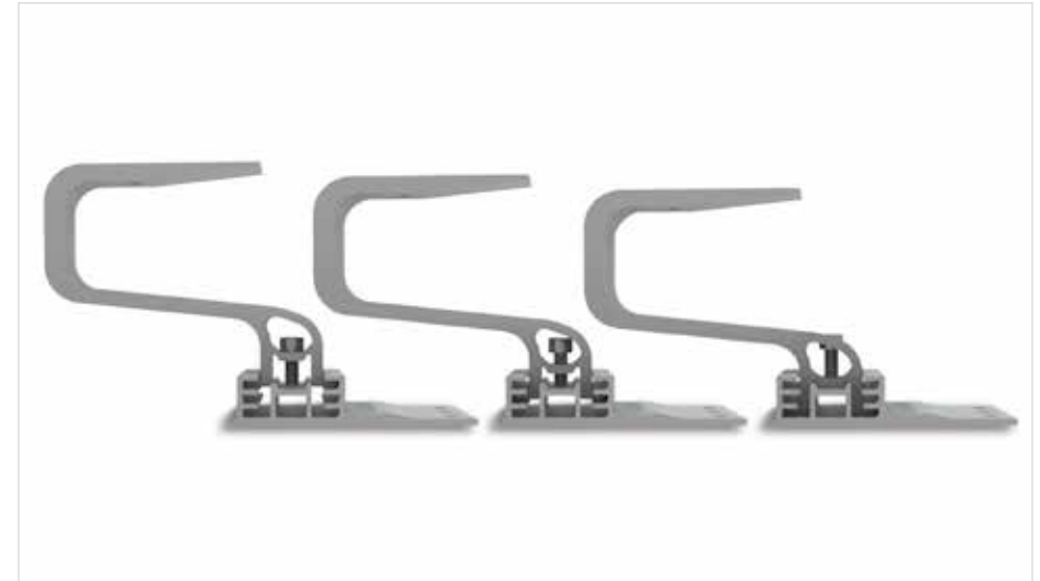
Detail illustration - adjustable height settings CrossHook 3S Adjustable height settings (40/47/54mm)