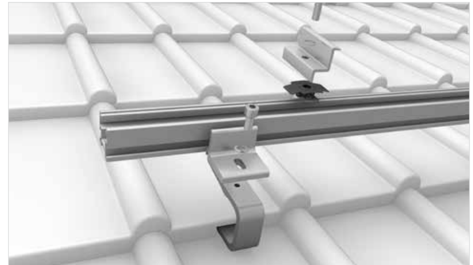
Explosion drawing - Montage CrossRail